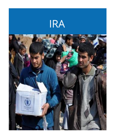
Immediate Response Account