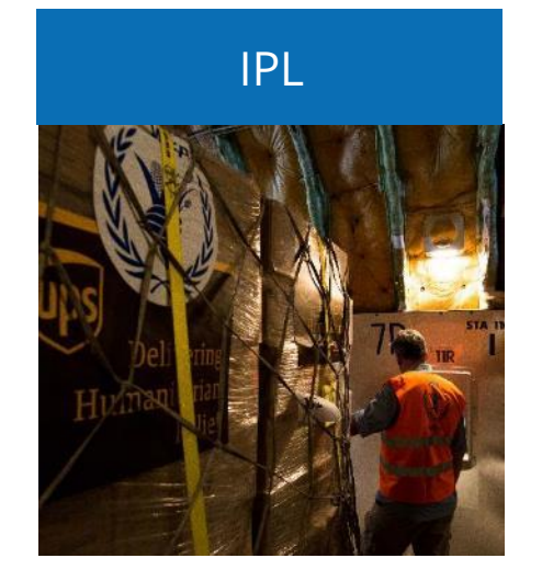
Internal Project Lending and Macro-Advance Financing