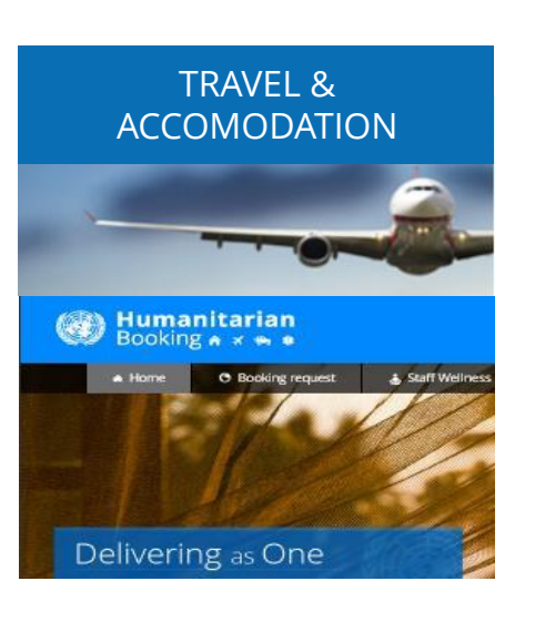
24/7 humanitarian booking tool for UN guesthouses, UNHAS flights and UN clinics