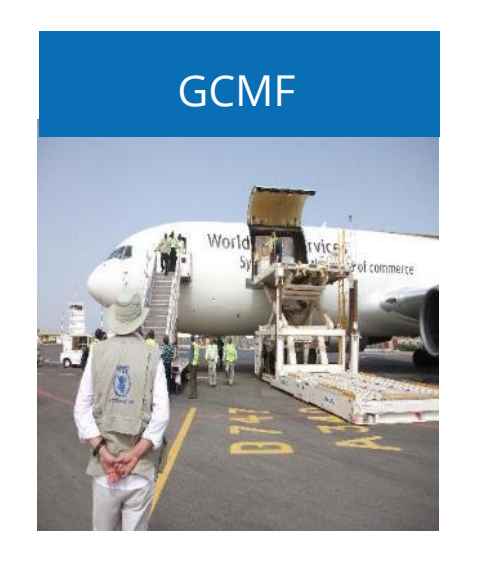
Global Commodity Management Facility