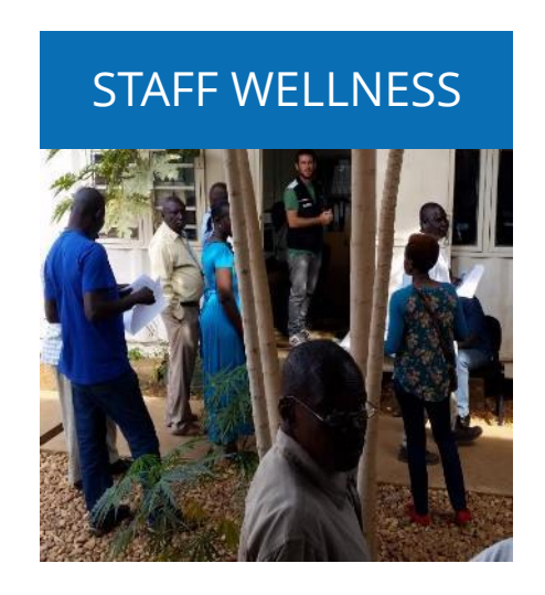
Vaccination Campaign in South Sudan