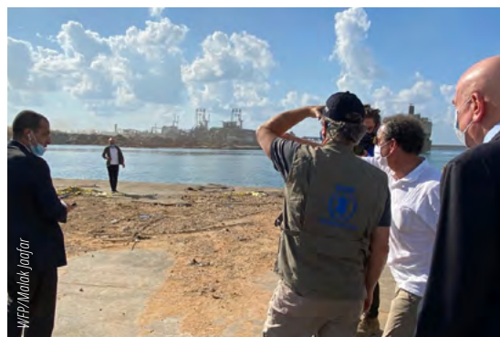
WFP Executive Director David Beasley surveys damage to the port in Beirut, Lebanon.

"This is a country that was already devastated because of economic deterioration, the war in Syria, COVID on top of all of that, and now, this explosion. It's very critical that we get this operation up immediately – and we're going to do that. We're going to do what we can to provide the food that's necessary in the short term, and get the port operating so we can provide support to the millions of people that are going to need help here in Lebanon."