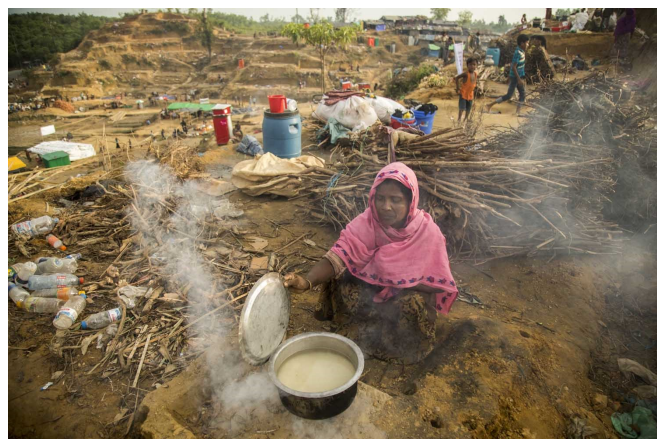
Photo: A woman cooking rice provided by WFP. Kutupalong, Bangladesh ©WFP/Saikat Mojumder