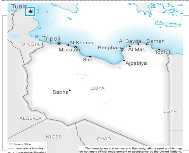
WFP staff discuss with people coming to receive their monthly food parcels at a distribution in Tripoli, Libya