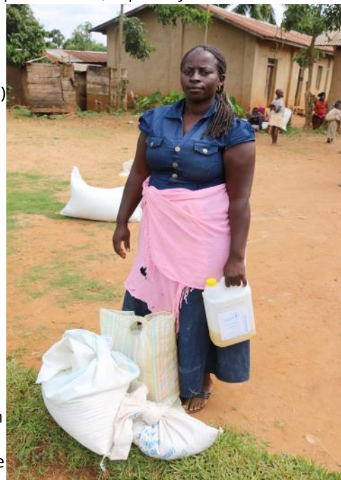
Photo: A woman in Beni who has been in contact with suspected Ebola cases receives food.

The Ebola response remains underfunded and WFP is currently reviewing its requirements for the months to come. Additional funding will be required to sustain WFP’s support to the Ebola response in the continued fight against the virus.