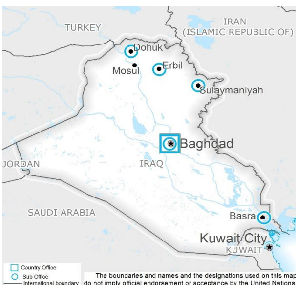
Iraq: EMOP 20067 (IDPs); PRRO 200987 (Refugees)