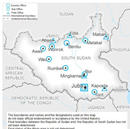
Photo: WFP Says No to Gender Based Violence is part of the UN Secretary-General's campaign to End Violence against Women (UNiTE)