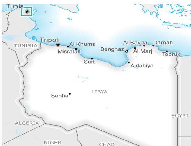
Libya Emergency Response