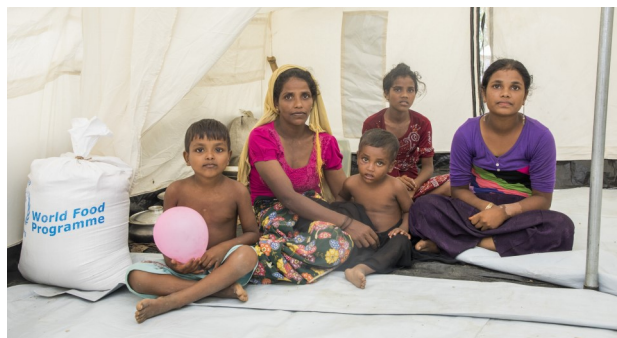
Photo: A family with their rice assistance in a UNHCR transit point, Kutupalong, Bangladesh ©WFP/Saikat Mojumder