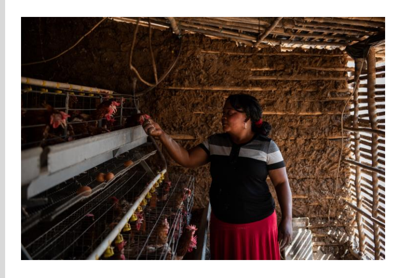
Page 1: Food for Assets Reconstruction Activities for cyclone affected populations Page 2: Egg production by Refugees in Nampula province