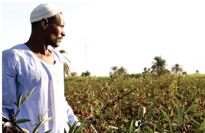
A hibiscus field in Tomas 3 village, Luxor. With enhanced extension services and consultancy package on high value cash crops, farmers are able to achieving higher yields and more income stability.

The above tools sought to obtain input on aspects that would influence the project design from different perspectives. Equally important was to widen the base for stakeholder engagement in the early phases of the project cycle.