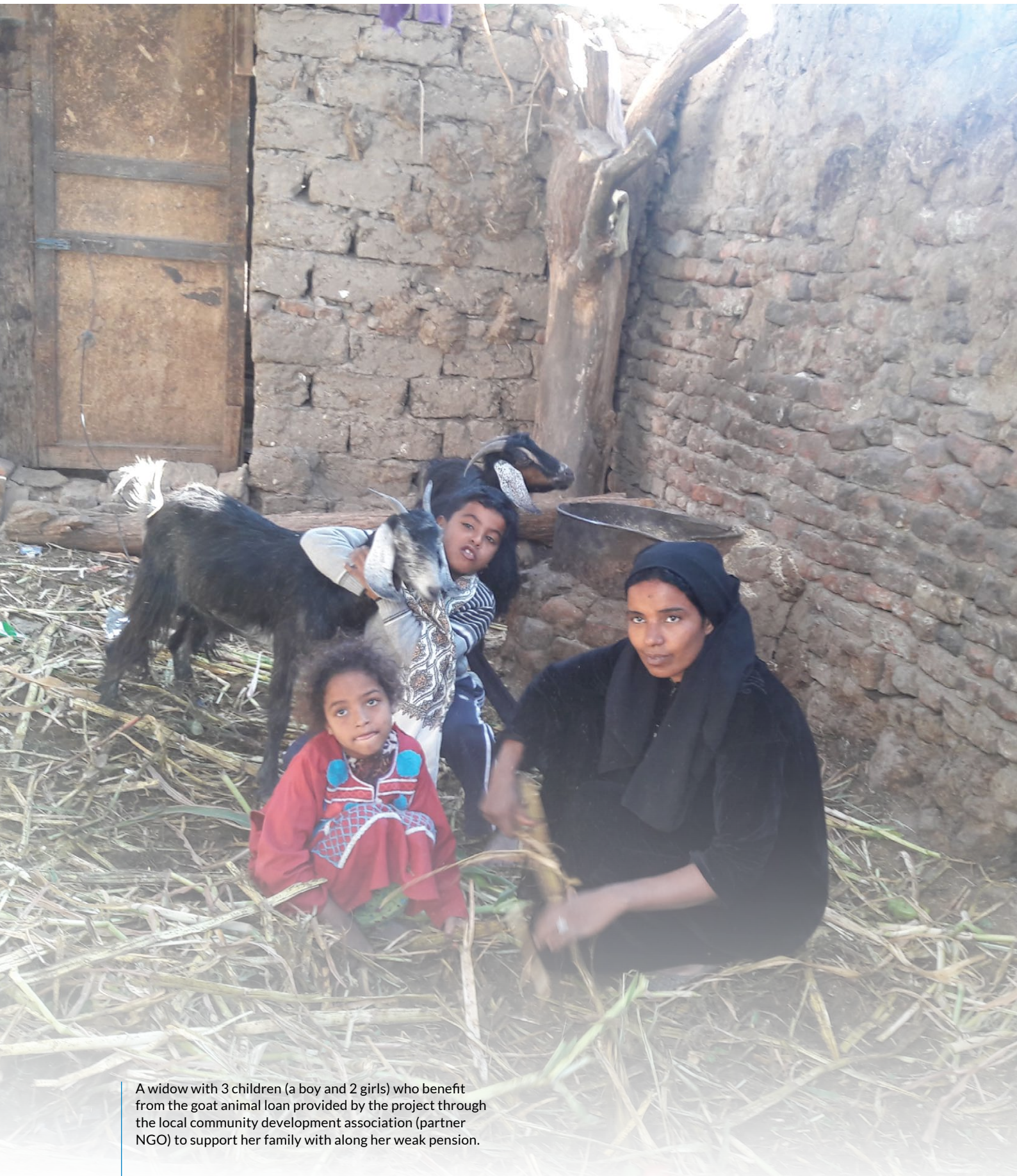
A widow with 3 children (a boy and 2 girls) who benefit from the goat animal loan provided by the project through the local community development association (partner NGO) to support her family with along her weak pension.