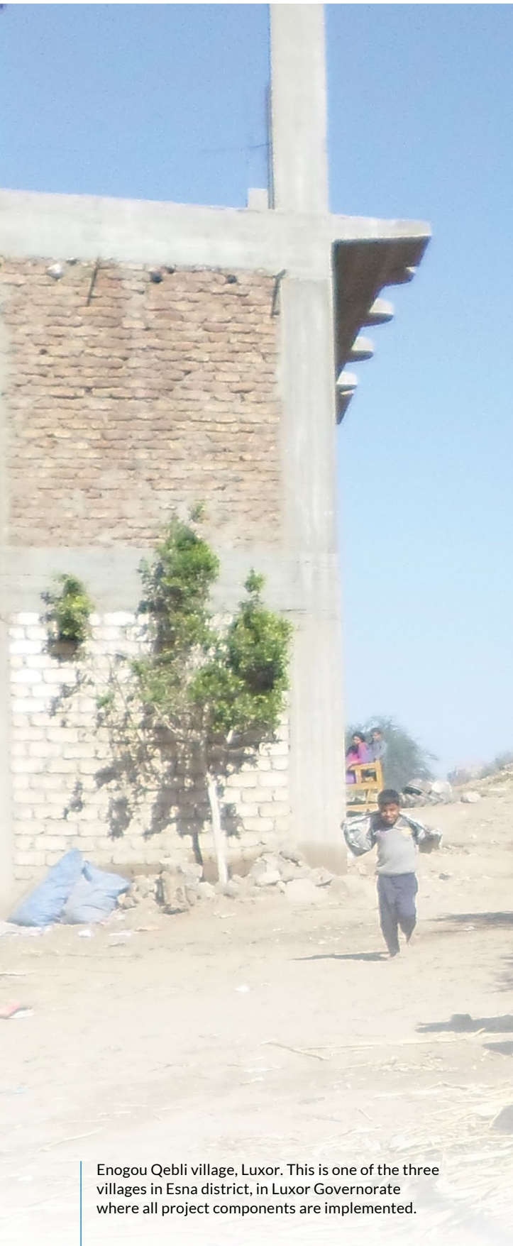
Enogou Qebli village, Luxor. This is one of the three villages in Esna district, in Luxor Governorate where all project components are implemented.