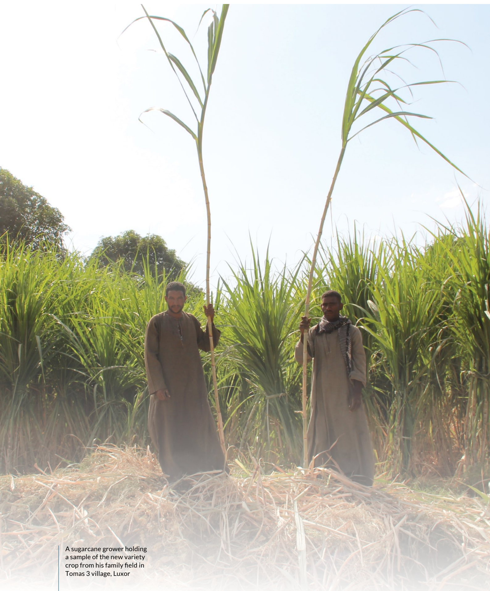
A sugarcane grower holding a sample of the new variety crop from his family field in Tomas 3 village, Luxor