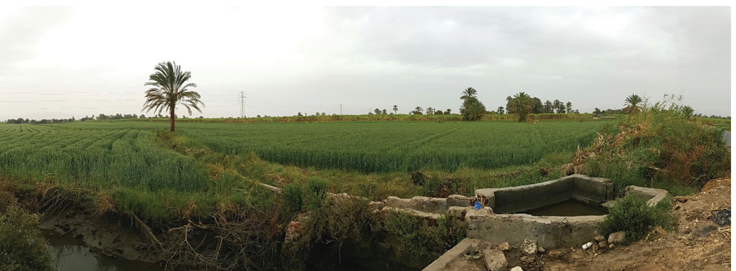
7 Farmers have participated in land consolidation intervention and cultivating new wheat varieties in Enogou Qebli village, Luxor.