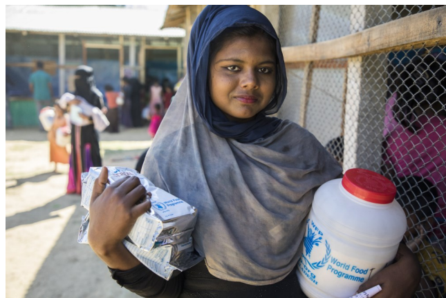
Photo: A woman collecting her SuperCereal rations from the Balukhali blanket supplementary feeding programme site, Bangladesh ©WFP/Saikat Mojumder