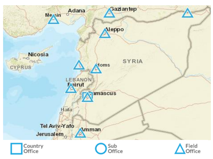
Caption: WFP provides food and nutrition assistance in southern Syria.

Transitional Interim Country Strategic Plan (TICSP) (July-December 2018) USD 247.3 million