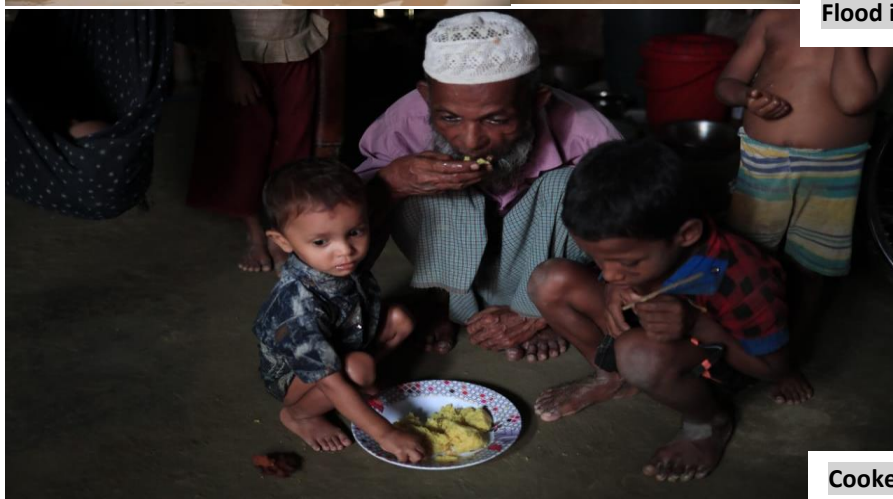
Cooked meals provided to people whose homes are washed away by the rain