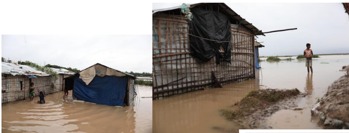
Flood inundated areas in Teknaf