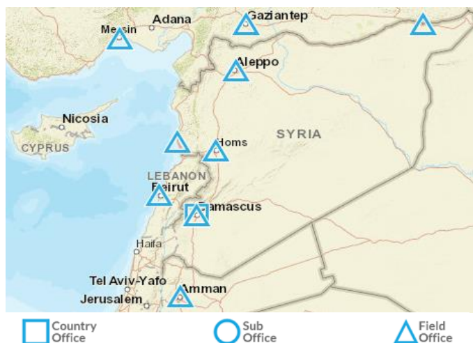
Caption: Food distributions in Ein Issa camp in Ar-Raqqa.

* The 2018 HRP is currently being finalized