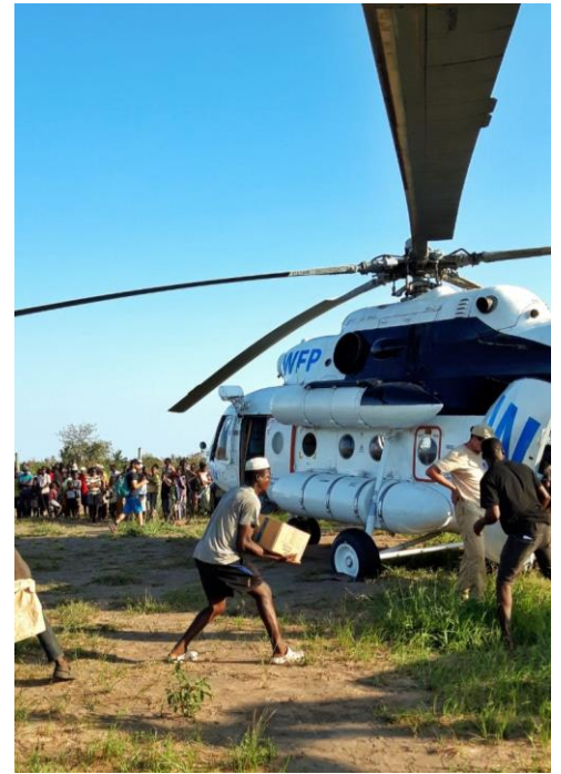
WFP Contract MI8 helicopter

WFP: Estimated number of people in need of food assistance by District (in thousands) - 24 th March 2019