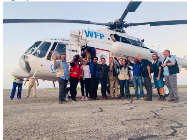
WFP Executive Director, David Beasley, with the WFP team in Beira