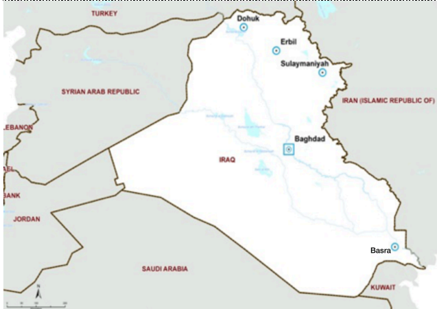
Photo: Zarifa, a farmer in Sinjar, Ninewa, was able to cultivate peas in a greenhouse for the first time with help from WFP Iraq's resilience project. She is looking forward to harvest.