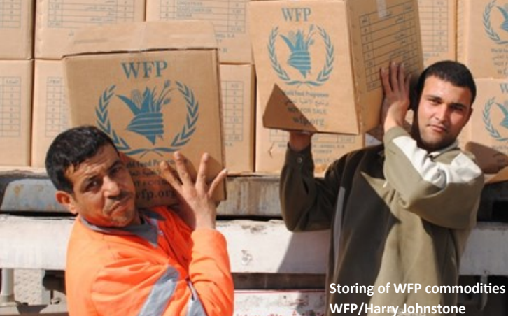
Storing of WFP commodities