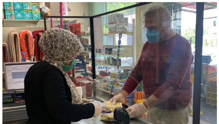
Photo: WFP and its partners have prioritised implementing all safety and hygiene measures to ensure the safety of staff and beneficiaries amidst the COVID-19 outbreak.

WFP Lebanon and its partners are working to ensure that all beneficiaries who redeem their assistance at WFP-contracted shops do so safely. Products, shelves, counters and trolleys are regularly disinfected as shop owners follow hygiene measures to ensure everyone returns home safely with their needed assistance.