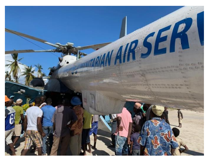
WFP UN Humanitarian Air Service offloading in Ibo Islands