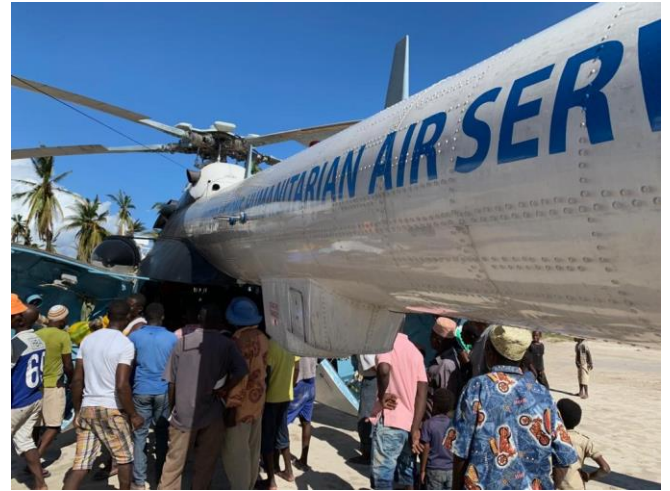
WFP UN Humanitarian Air Service offloading in Ibo Islands