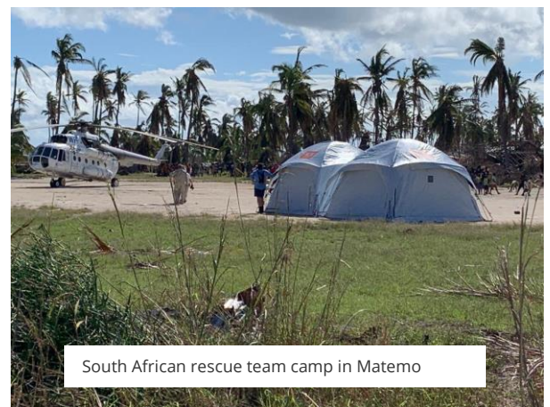
South African rescue team camp in Matemo