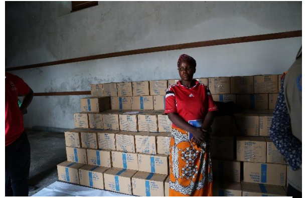
WFP partner storage facility receiving high energy biscuits in