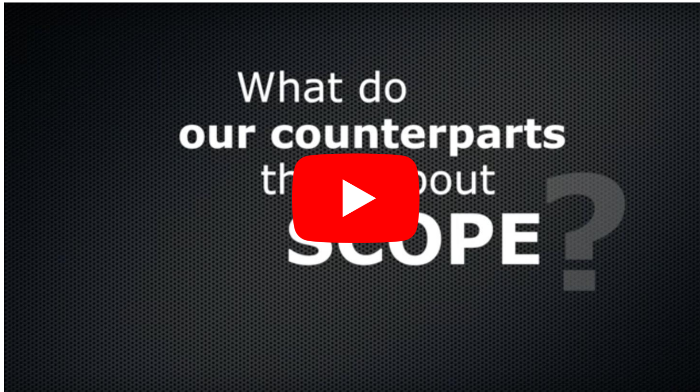
Testimonials - Bangladesh, Guatemala, Somalia