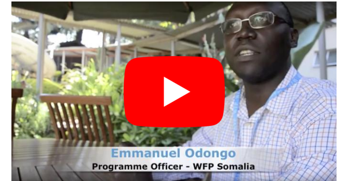
Programme Officer, Somalia