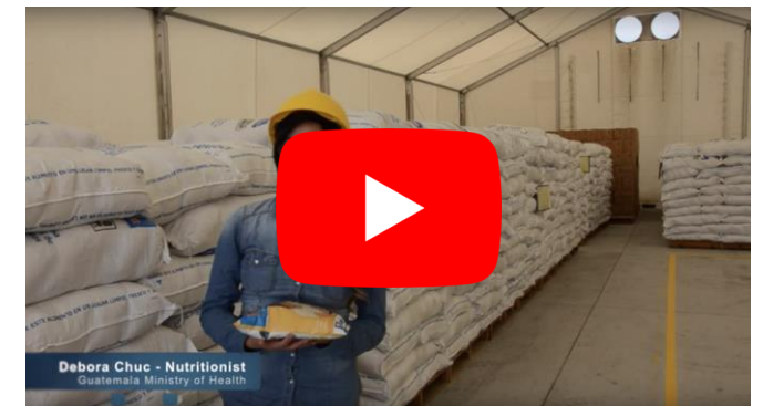
Health Ministry, Guatemala