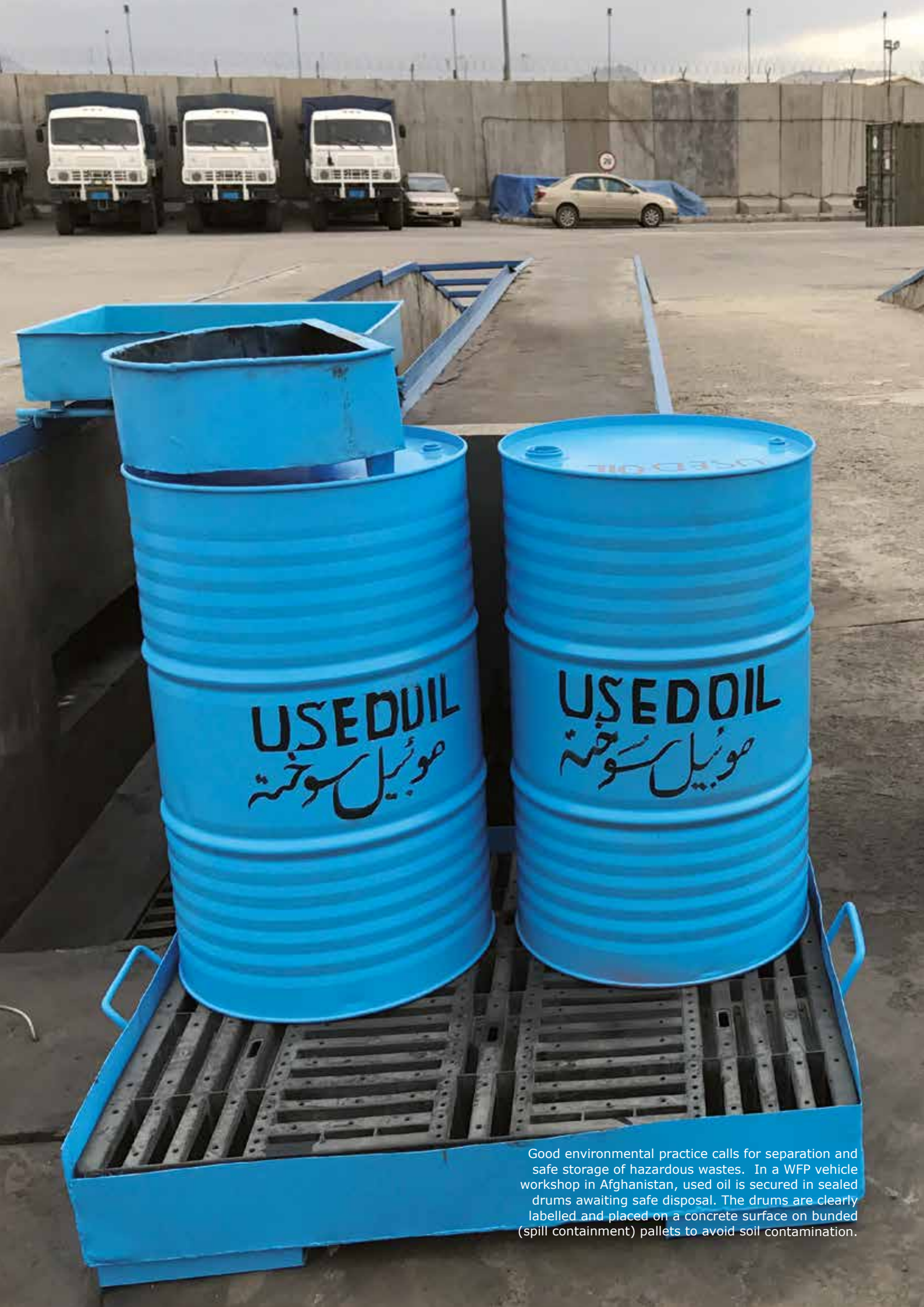
Good environmental practice calls for separation and safe storage of hazardous wastes. In a WFP vehicle workshop in Afghanistan, used oil is secured in sealed drums awaiting safe disposal. The drums are clearly labelled and placed on a concrete surface on banded (spill containment) pallets to avoid soil contamination.