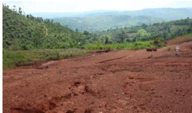
Quarry Colline de Rushanga