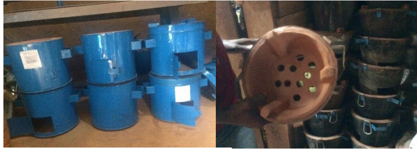
GIZ supported Stove, 12000 BIF, made from purchased steel from Buiumbura

Firewood is only traded and sold if a tree falls, or if material from old houses are sold. In the community none of the families indicated to ever have seen or used a fuel-efficient stove for cooking or alternative energies to firewood, leaves or grass. There are two locations that are visited for trade: