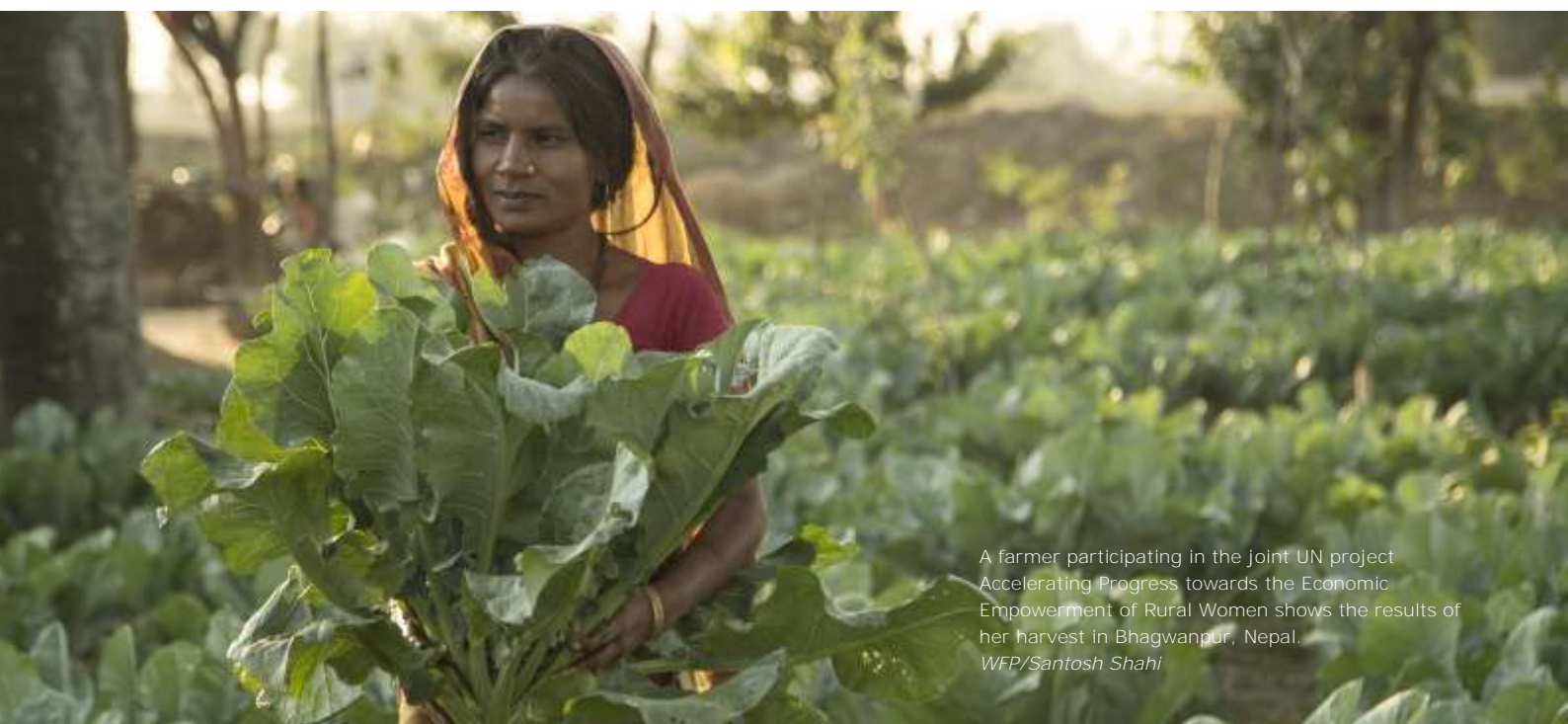
A farmer participating in the joint UN project Accelerating Progress towards the Economic Empowerment of Rural Women shows the results of her harvest in Bhagwanpur, Nepal.

Application of the gender-transformative approach to food security and nutrition applies fully to smallholder-related food assistance interventions. For example, under P4P, HGSM, and FtMA, women smallholders' economic empowerment is pursued through three major channels: (1) women's participation in sales to WFP and other formal markets; (2) women's participation and leadership in FOs; and (3) women's influence over decisions at the household and FO level related to agricultural production, marketing, and profits from sales. More broadly, since adopting the IASC Gender Marker that tracks whether a project fully addresses the particular needs, vulnerabilities and priorities of women, men, girls, and boys the percentage of WFP projects with a potential to contribute significantly to gender equality have increased from 24 percent in 2012 to 100 percent in 2016 (WFP, 2017g).