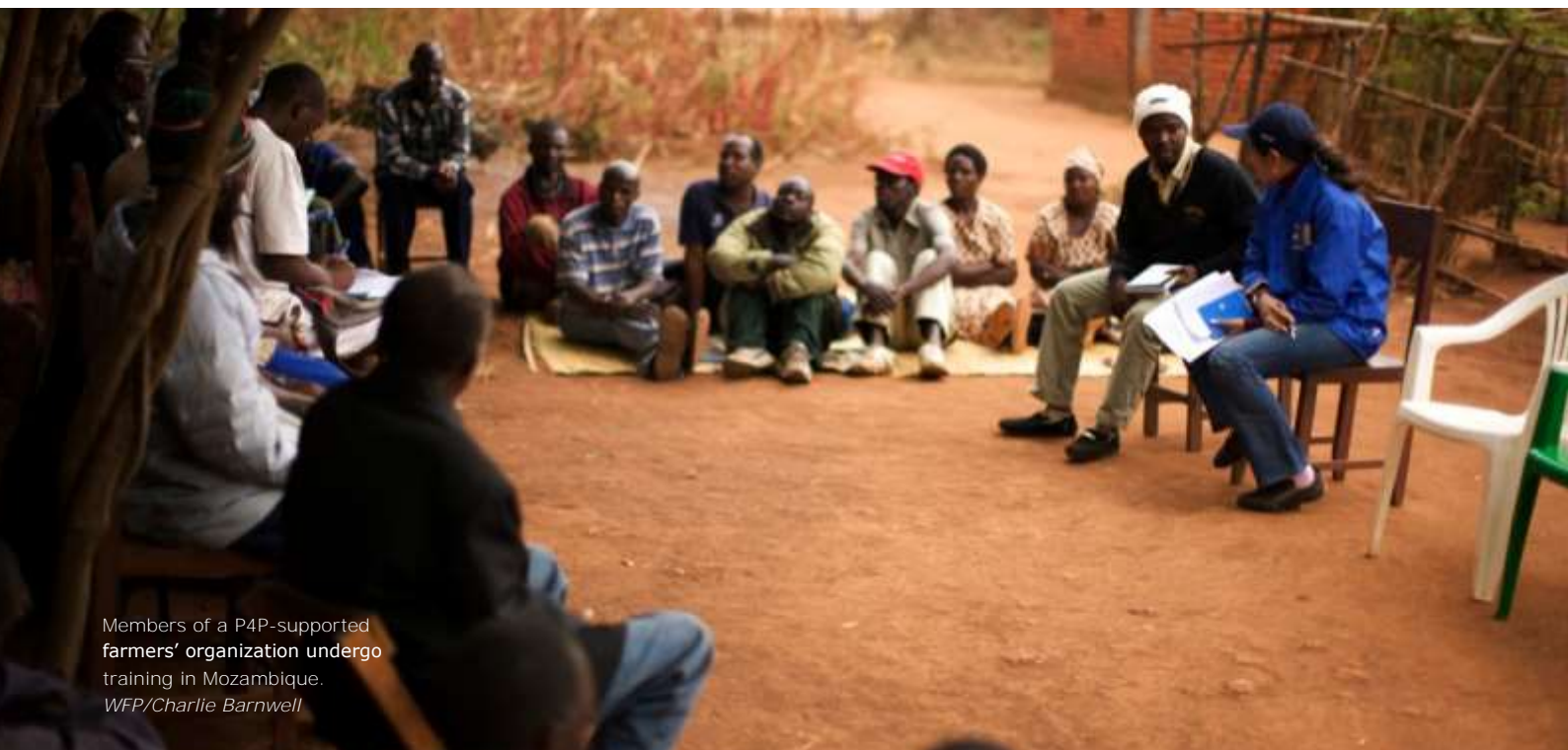
Members of a P4P-supported farmers' organization undergo training in Mozambique.