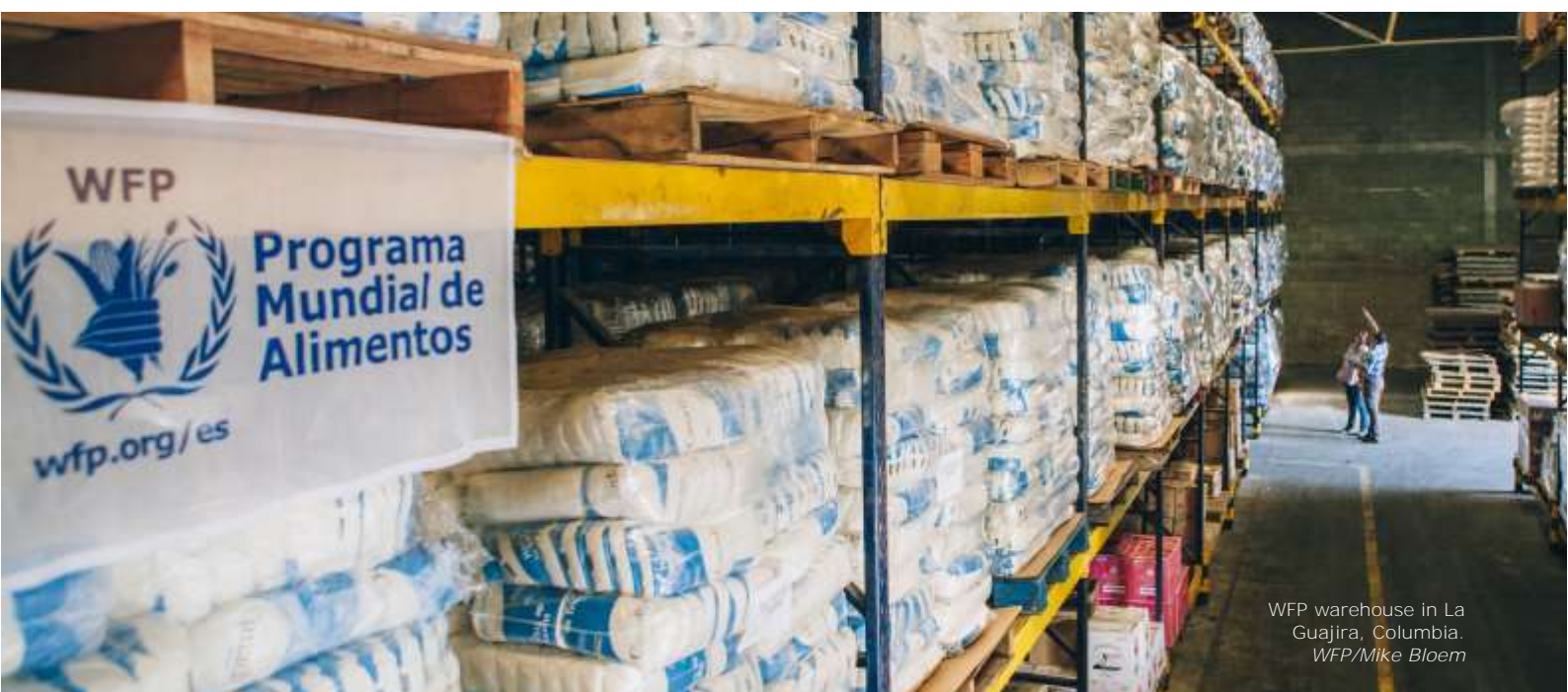
WFP warehouse in La Guajira, Colombia.

Experience and analysis suggest that pro-smallholder food assistance raises several risks for COs and for WFP more broadly. They fall within falling within eight categories: smallholder production and productivity, smallholder storage and aggregation, smallholder and farmers' organization marketing, farmers' organization capacity, gender equality and women's empowerment, buyer behaviour, enabling environment, WFP staffing, programme design, and implementation . These must be addressed through context-specific mitigation measures. These are summarized in Table 6, along with proposed mitigation measures.