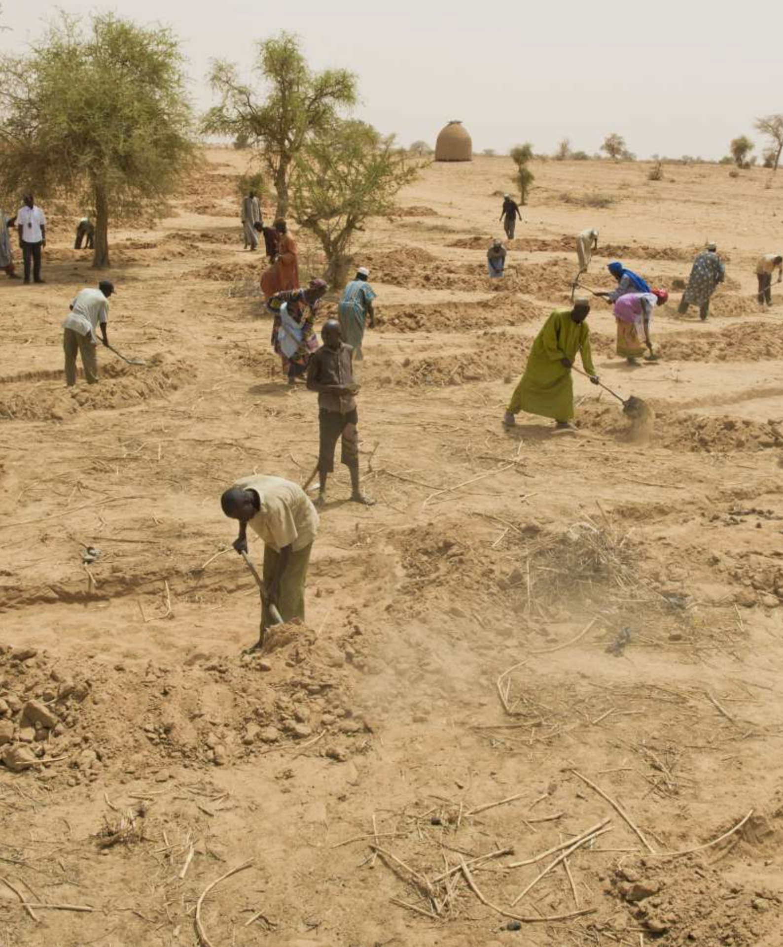
FFA participants construct half-moons from soil to improve water conservation in Koumari village, Dosso, Niger.