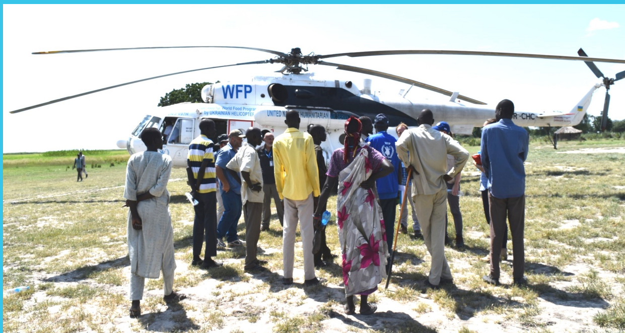
WFP mission members and local community from Tonga