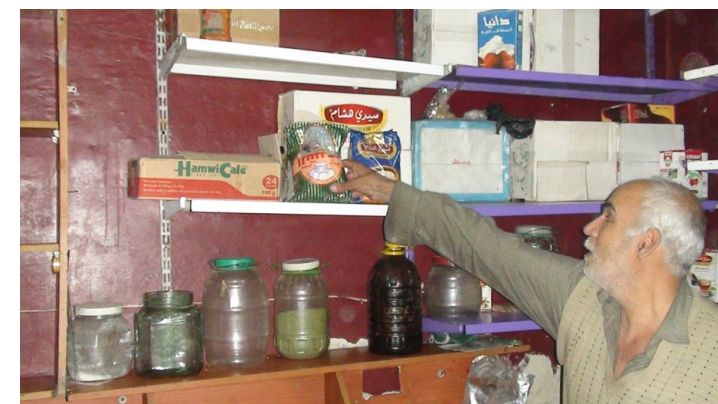
“The total available stock in my shop is half a pack of lentils and some condiments” Interview with one of the traders in the picture above.

Furthermore, many traders, customers and key informants in markets indicated that more than 60 percent of their sales are on credit due to customers’ limited liquidity and poor purchasing power.