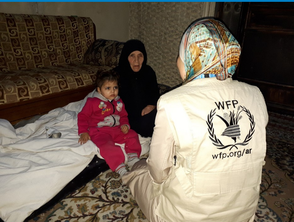
WFP Syria - Household interview in Kafr Batna