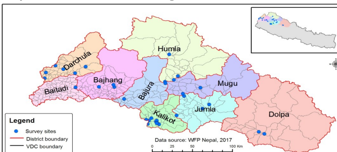
Map 1: mVAM market monitoring sites

** Price fluctuation is considered normal if the price change is within 5% for 1 month, or within 10% for 3 months or within 15% for one year.