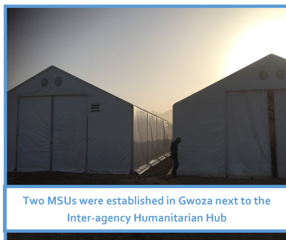
Two MSUs were established in Gwoza next to the Inter-agency Humanitarian Hub