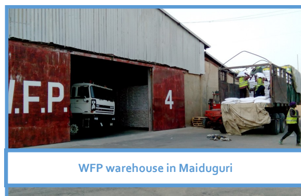
WFP warehouse in Maiduguri