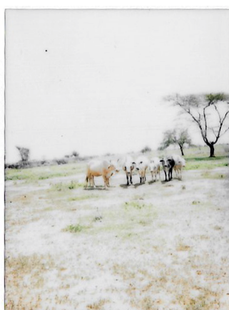
A picture of thirst - Atedeoi, Moroto District.

Across Moroto, both adolescents and adult participants reported that the recent lack of rain had significantly affected harvest yield, resulting in less food being available. Poor weather had also resulted in communities having to use more distant kraals to graze their livestock, which removed animals as a source of food from the manyattas . The lack of available water and pasture had also led to elevated rates of animal death. Not only did this reduce availability of meat and animal products, but it also reduced household assets at the very time that families needed to sell livestock to buy foodstuffs from market. In their photowalk activities, adolescents in Moroto documented the poor harvest, taking photographs of barren land and empty granaries. In Atedeoi, they highlighted the impact on their livestock, and as one girl explained, 'my photo is a picture of thirst. The animals are hungry and struggling to look for grass since the ground is bare and [they] have no water for drinking' . In Moroto, participants