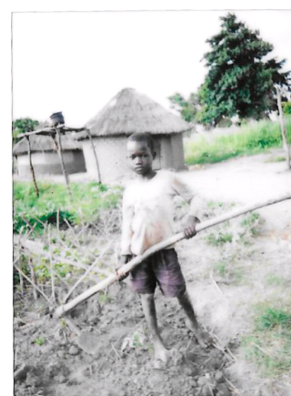
Boy digging - Host Community, Mungula, Adjumani District