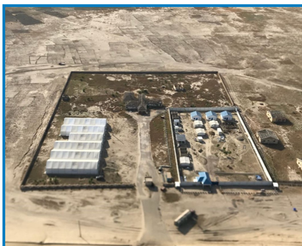
Six MSUs have been established in Ngala, next to the Inter-agency Humanitarian Hub; four for WFP food operations and two for the Logistics Sector common storage.

WFP has temporarily provided 15 Mobile Storage Units (MSUs) to seven organisations in 10 locations.