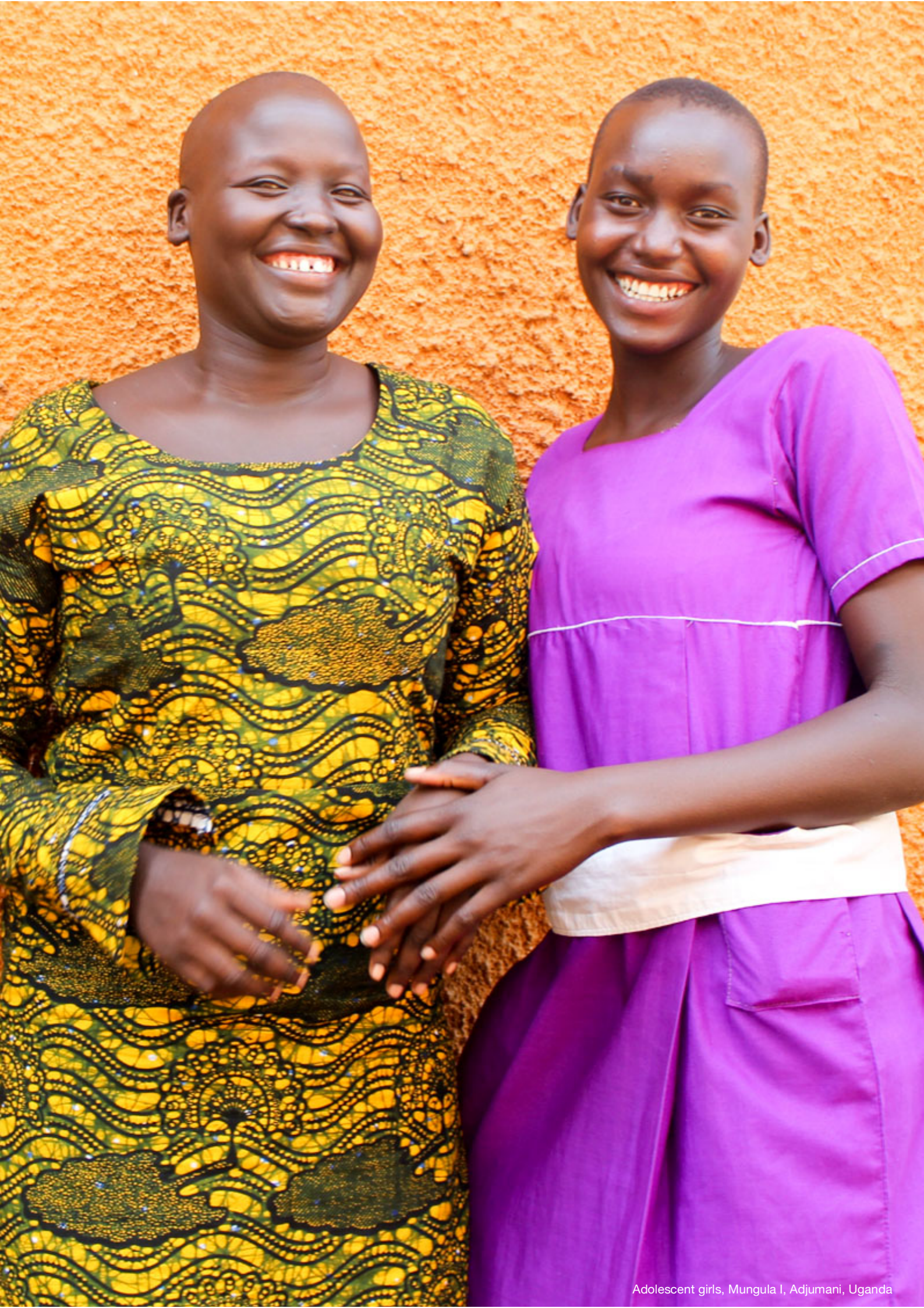
Adolescent girls, Mungula I, Adjumani, Uganda