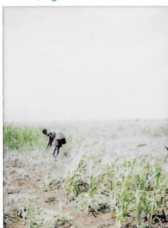
'This is our drought'.