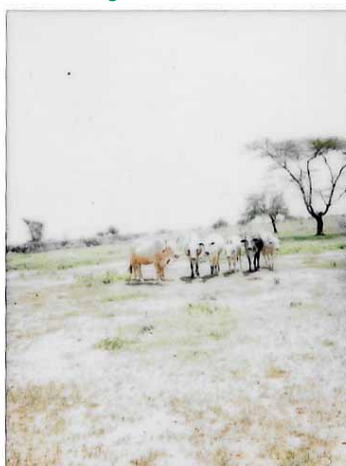
'A picture of thirst'.