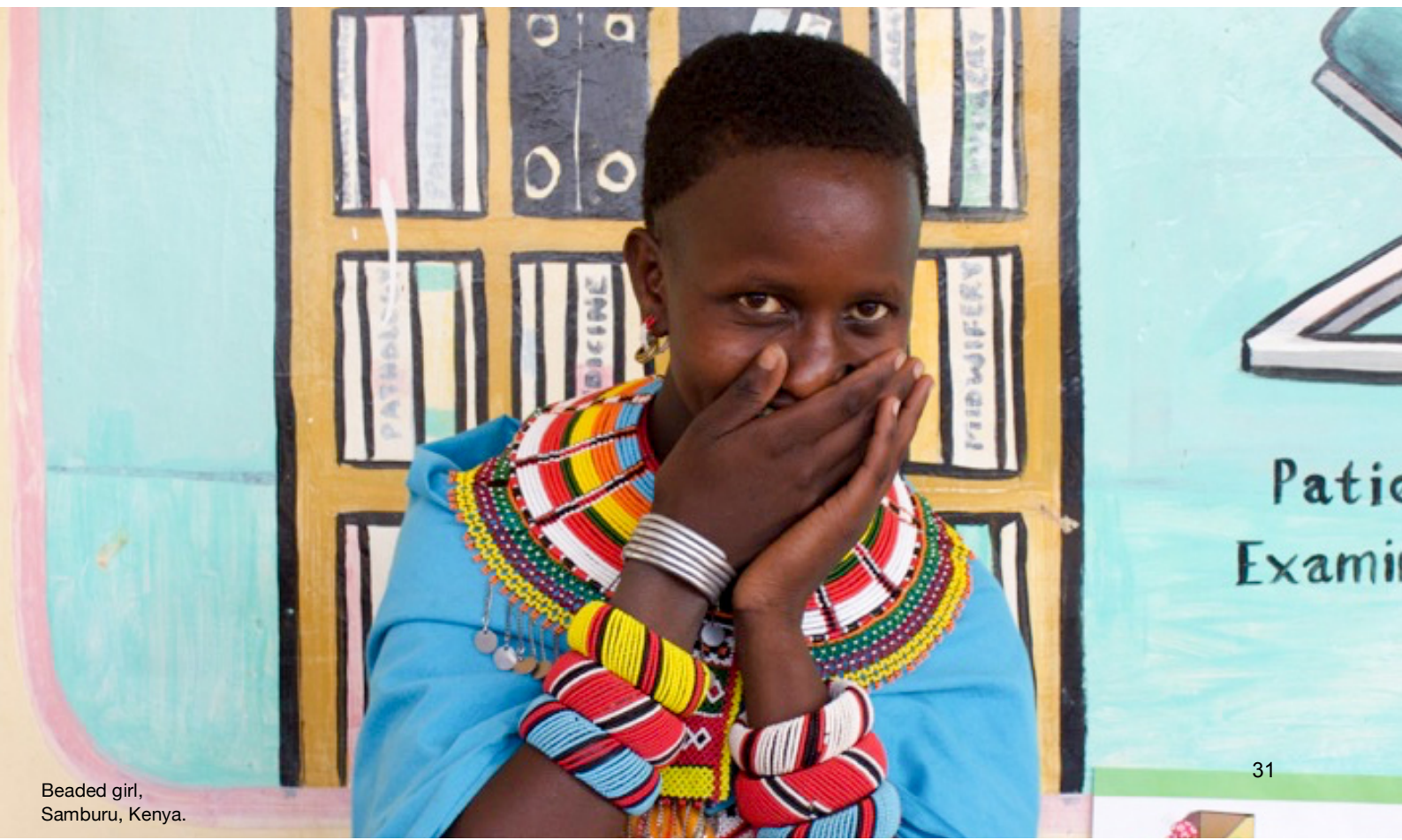
Beaded girl, Samburu, Kenya.

In contrast to the other field sites, sexual exploration at the onset of puberty was the social norm for both girls and boys in the ethnic communities in Ratanakiri. This contributed to a