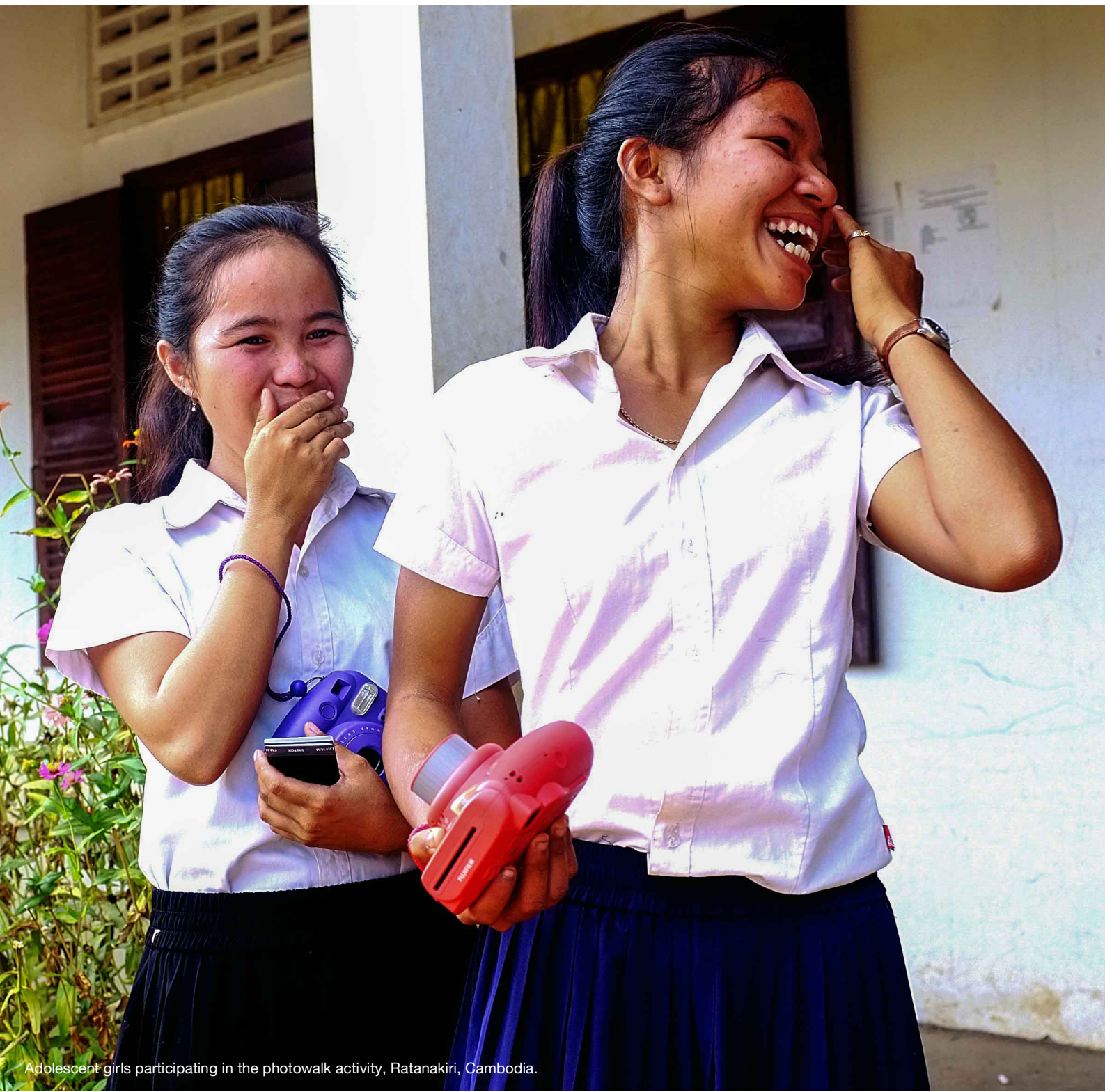
Adolescent girls participating in the photowalk activity, Ratanakiri, Cambodia.

nutrition (income-generation activities; climate and agricultural practices; social norms and restrictive food practices; security, substance abuse and alcohol; education and school attendance; sexual and reproductive health; and services delivery issues). In comparing and contrasting the country-specific studies, a number of core recommendations emerged: to strengthen the visibility of adolescents; to influence adolescent nutrition; to engage with adolescents; to identify platforms for engagement; and to maximise key entry points for strategic partnership. By combining the formative research findings and stakeholder mapping, evidence-based recommendations have been designed to improve nutrition-specific and nutrition-sensitive interventions for adolescents, and to highlight opportunities for adolescent engagement regarding nutrition.