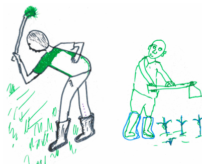
'You get a lot of food when you dig' . 13 year old boy, Adjumani, Uganda.