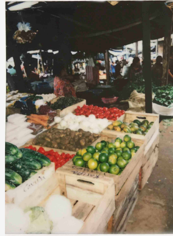
'Food my mother buys at Chisec market'. Photo by 15-19 year old girl, Alta Verapaz, Guatemala.