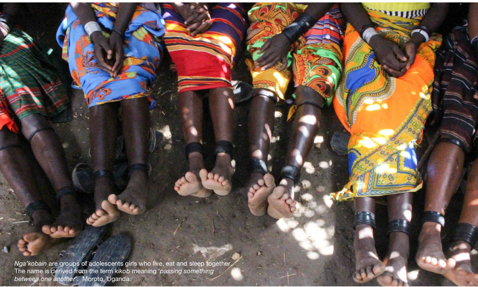
Nga'kobain are groups of adolescent girls who live, eat and sleep together. The name is derived from the term kikob meaning 'passing something between one another'. Moroto, Uganda.

In Kenya and Uganda, early marriage was often initiated by caregivers to secure their daughter's bride price. This was particularly evident at the time of the research as the recent droughts had left many families with limited resources (depleted livestock, food reserves and