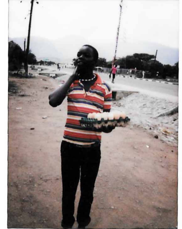
'Selling eggs'. Photo by 15-19 year old girl, Moroto, Uganda.

availability of transport), women preferred to buy their food from a selection of 'trusted' mobile sellers. This was seen to be more convenient and required fewer resources (in terms of time expenditure and out-of-pocket costs) than going to market.