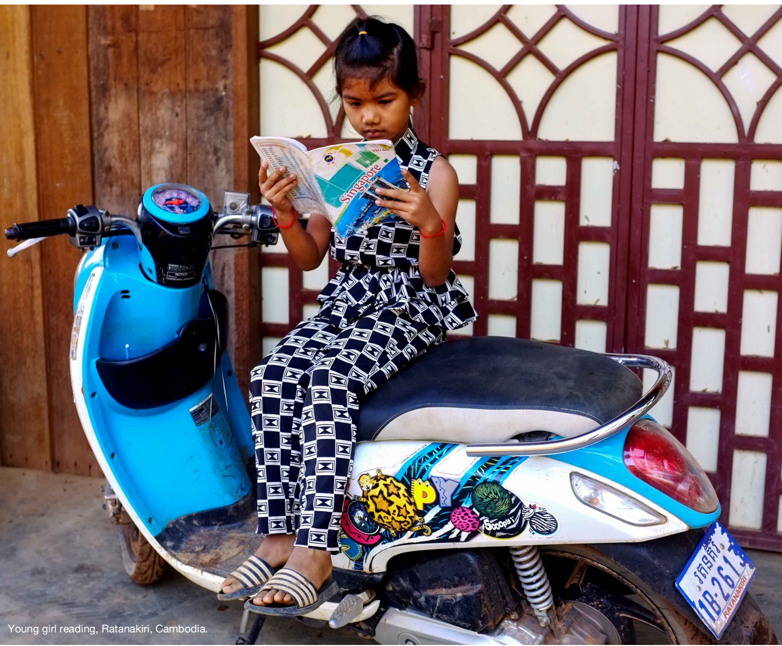
Young girl reading, Ratanakiri, Cambodia.

For the refugee population in Adjumani, the unpredictability of household ration supplies and recent cuts in the size of rations were also seen to be problematic in terms of food security and the ability to ensure good adolescent nutrition. Programme implementers agreed that 'communication with communities must be improved. When there are delays in food, it is serious' . This was particularly important for adolescent girls, who had many responsibilities within the household, largely around food, but often received information last. Adolescent refugees highlighted that rations did not always reach the most in need and suggested corruption in the system. In their participatory workshops, adolescent refugees in Adjumani explained that families would often resort to selling food rations to buy larger quantities of cheaper, lower quality goods.