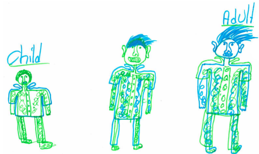
'This is me in the middle'. 12 year old boy, Meru, Kenya.