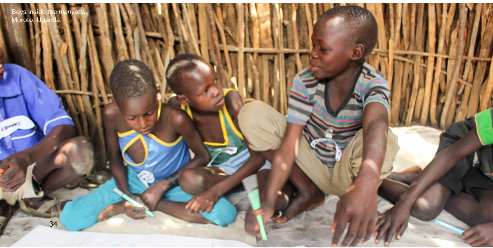
Boys inside the manyatta , Moroto, Uganda.

In Uganda and Kenya (apart from Samburu), adolescents expressed preference for being grouped together, unless interactions were likely to be particularly sensitive, in which case grouping by gender was more appropriate. In Cambodia and Guatemala, girls were more likely to propose girl-only groups. In all countries, adolescents also suggested grouping according to life stages: married girls and young mothers should be engaged separately from unmarried girls; older boys separately from younger boys; and some suggested that in-school adolescents should be engaged separately from those who were out of school.