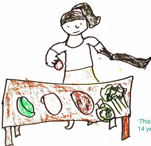
'This is me preparing food'. 14 year old girl, Alta Verapaz, Guatemala.