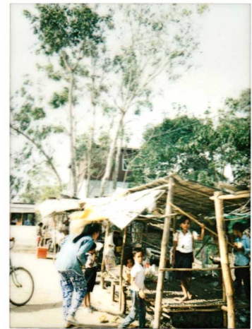
'Snack vendors outside the primary school'. Photo by 15-19 year old girl, Prey Veng, Cambodia.

person's body', including energy drinks, fried chicken that was not prepared at home, frozen chicken sold in shops, all canned food and, particularly relevant for adolescents, snacks (e.g. salted tortilla crisps) sold in colourful packaging, soft drinks and candy. Guatemala has a strong food processing industry that, through effective marketing and distribution, has made snack food only 'an arm's length from desire' (Nagata, 2010). Caregivers engaged across the field sites expressed their concern about the availability of so much 'bad' food near schools. Snacking was seen to be an issue facing older adolescents, both those in school who were given pocket money because they were not eligible for school feeding programmes, and those who had left education. The consumption of unhealthy, fatty and sugary food was particularly common amongst urban communities and, increasingly, the rural poor.