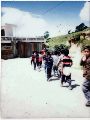
'The boys go to school, but not me'.

school was viewed by participants as protecting girls from pregnancy, discouraging early marriage, preventing child labour activities, and shielding boys from 'being idle' and the pressures of criminality, gambling and substance abuse. Many caregivers aspired to have their children complete school to protect them from a 'hard life' and to improve their life trajectories and in Guatemala, for example, adolescents confirmed their desire to have a good education 'for the future' that would enable them to 'work in the city with clean clothes'.