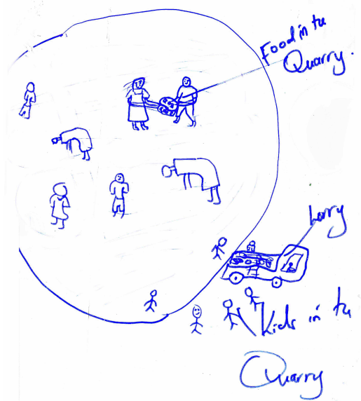
'There is no need for us to allow food to be thrown away whilst we are starving'. 18 year old girl, Nairobi, Kenya.

Food aspirations were thrown into sharp relief in Ngomongo and Utalii in Nairobi. Adolescents recognised that whilst they lived in one of Africa's most developed cities, they were themselves entrenched in poverty. Being linked to wealthy Nairobi through geographical proximity and through objects on the dumpsite, adolescents saw and literally tasted 'the other side'. Adolescents listed food they desired including cakes, pizza and other items perceived as 'rich people food', even if they could only acquire them from the dumpsite. A sense of shame and injustice was strongly intertwined with