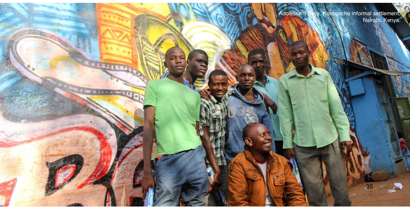
Adolescent boys, Korogocho informal settlement, Nairobi, Kenya.

Adolescents wanted engagement activities to build their skills and interests. They were most receptive to learning when it was incorporated into activities they enjoyed and were good at and which prioritised issues they identified to be important. Participants emphasised the importance of engaging adolescents holistically, providing health and nutritional information alongside sexual and reproductive health services, education and vocational training.