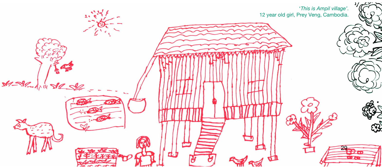
'This is Ampil village'. 12 year old girl, Prey Veng, Cambodia.

With limited economic resources, caregivers often had to choose which child or children to send to school, and across the four countries, a boy's education was usually prioritised over a girl's. It was well accepted that adolescent girls, particularly older girls, would leave school to help shoulder the burden of housework and care for siblings. In Ratanakiri, Cambodia, girls admitted that school provided a 'welcome break' from their heavy chores, yet attendance frequently led to a sense of guilt. They explained that an education could feel like an indulgent