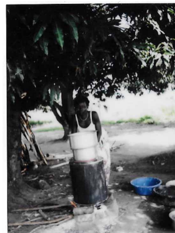
'Brewing alcohol' . Photo by 15-19 year old girl, Moroto, Uganda.

Alcohol was discussed by adolescent participants in all four countries. In Cambodia, girls made and sold the local rice wine that was consumed regularly by all members of the community, including, at least in Ratanakiri, children and younger adolescents. In both Kenya and Uganda, adolescents were also heavily involved in the brewing business and girls documented both brewing and selling alcohol in their participatory workshops. Selling alcohol was a major source of income and a way to generate sufficient resources to buy food. As in Guatemala, drinking alcohol was highlighted as a common strategy to overcome hunger, but in Uganda, alcohol was also considered a food source in itself. In Moroto, Uganda, adolescent girls reported drinking one or two cups per day ( 'it's like our breakfast' ), and both there and in the sites in Kenya, the residue created during the brewing process was eaten 'to fill the stomach' . As one 12 year old boy in Moroto explained, 'sometimes we sleep hungry or only with [alcohol] residue, until again you go back to school, where you eat' . It was notable that amongst the host community in Adjumani, Uganda, girls suggested, 'young girls should not brew. The government should encourage people to cultivate and sell their produce in order to get money instead' .