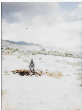
'Boy with carcass'. Photo by 15-19 year old girl, Samburu, Kenya.