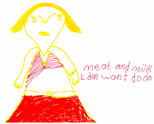
'I want meat and milk. I don't want dodo [leafy green vegetable]'. 12 year old girl, Moroto, Uganda.

Participants in Samburu, Kenya, expressed boredom with their uniform diets and wished for more diversity in their food. Married girls and morans confirmed a preference for the food they 'grew up liking'. Adolescents in school, however, discussed their aspirations for spaghetti, chapatti and rice, all foreign foods that were novel and different to their normal diets. Similarly, in Meru, Kenya, adolescents prioritised their desire for foods that were novel, fast, energy-giving, filling and 'fashionable' although 'traditional' knowledge about healthy foods, passed down orally between generations, also held significance for adolescents.