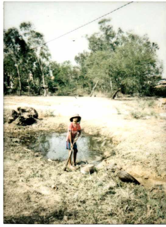
'Boy fishing in a small pond'.