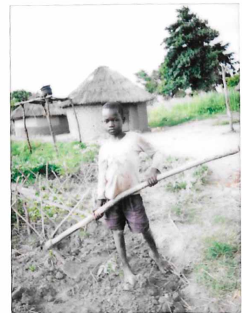
'Boy digging' .

Adolescents living in farming communities were often dependent on the local harvest. For the host community in Mungula, Adjumani, Uganda, for example, the fertile land was the primary source of food. Adolescents expressed great emotional attachment to their land, and in Mungula, digging was commonly documented in both their drawings and photowalks. The land was perceived not only as a source of food, but also in terms of its income-generating potential so that more varied foods could be purchased and households had more resources. Both adolescent and adult participants expressed great respect for the land and an appreciation of what it could offer. As one adolescent girl from the host community explained, 'you get a lot of food when you dig' . Those with enough land could produce cassava, beans, cowpeas and other crops such as maize, which they could sell to buy rice, meat and fish. In Meru, Kenya, the majority of produce was grown to be sold. A small portion of land may be reserved to produce staple foods for the household, but most foodstuffs were purchased from the local market. Similarly, in Guatemala, farmers dependent on cash crop farming preferred to sell their produce at market, using the profit to purchase food for the household. In Ndoto, Samburu, Kenya, food could be purchased from markets and the trading centre, but the major food source was the community's livestock (cattle and goats), although herds were seriously depleted at the time of the study.