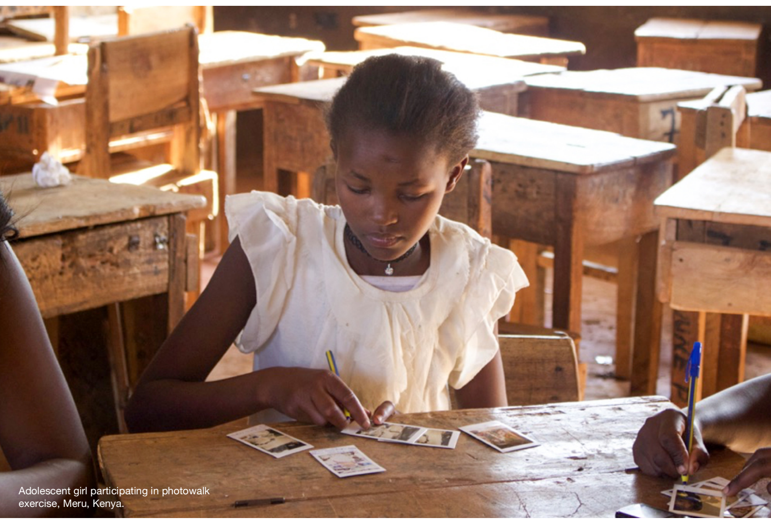
Adolescent girl participating in photowalk exercise, Meru, Kenya.