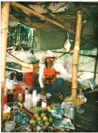
'Woman selling fruit and soda by the school'. 15-19 year old girl, Prey Veng, Cambodia.