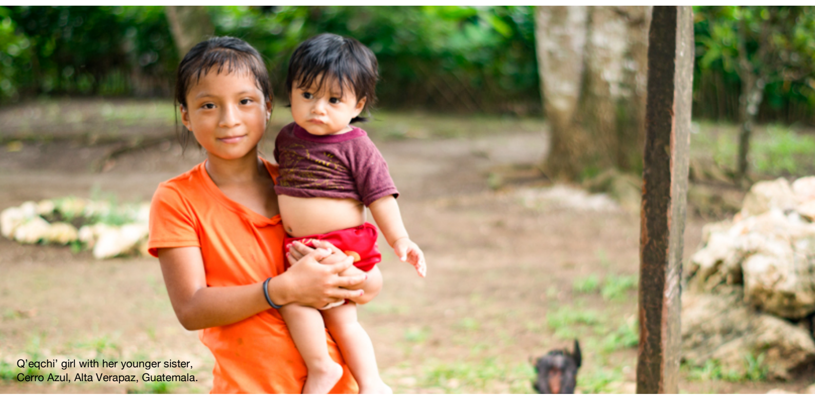
Q'eqchi' girl with her younger sister, Cerro Azul, Alta Verapaz, Guatemala.

A number of national policies address health and nutrition needs of adolescents, including the Uganda Nutrition Action Plan, the Uganda Multi-Sectoral Nutrition Policy, the National Anemia Policy, and the School Feeding Policy. Other policies of relevance, pending at the time of research, included the School Health Policy; the National Multi-National Sectoral Framework for Adolescent Girls; the Maternal, Infant, Young Child and Adolescent Nutrition Roadmap; and the renewal of the National Adolescent Health Strategy.