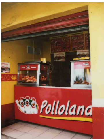
'I like to eat the pollo dorado [golden fried chicken]'.

Adolescent refugees in Mungula, Adjumani, Uganda, expressed preference for 'traditional' foods according to their cultural backgrounds. Whilst they suggested that traditional food and meat gave the most energy, they also expressed nostalgia for their homeland through their food preferences. Adolescent refugees were vocal in their dislike of the food they ate regularly, particularly staple green vegetables. During the time of data collection, the content of rations supplied to refugees in Mungula included oil, beans, maize and sorghum, but the portion of rations had recently been reduced. Because of the scale of the operation, rations needed to be uniform and cost effective, but adolescents confirmed the diet to be limited. As one adolescent boy concluded, 'now we are eating these things by force which are not in our heart'.