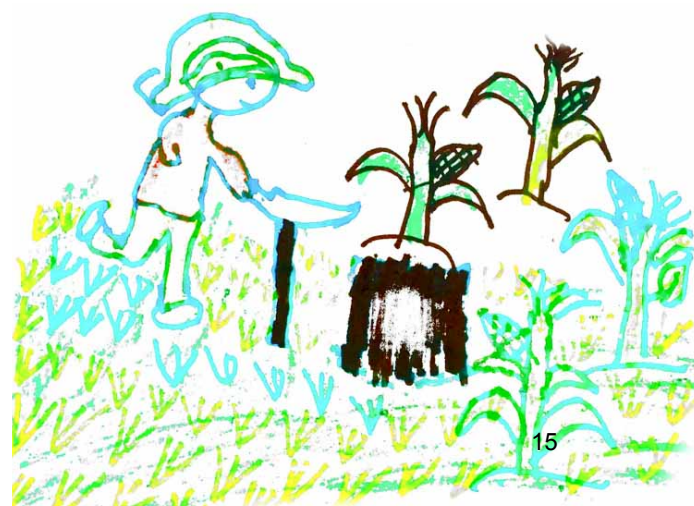
'Here I am chopping corn'. 14 year old boy, Alta Verapaz, Guatemala.

Increasing responsibilities for girls revolved around household chores, primarily sourcing, preparing and cooking food, and caring for younger siblings. Other common duties included fetching water and firewood, cleaning the home and washing clothes. Many of the adolescent girls who participated in the research discussed their heavy workloads and heightened responsibilities as difficult to manage, particularly if they had competing priorities such as school attendance. In the refugee communities in Adjumani, Uganda, where it was reported that household sizes were larger, the responsibility of adolescent girls for their siblings was particularly demanding. Adolescent girls and boys were also involved with farm work and income-generating activities (discussed in detail below), and in rural Guatemala a boy's maturity was measured by his ability to do hard physical labour. In Samburu, Kenya, adolescent boys (called morans , meaning warriors) assumed responsibility for the security of the community and for taking care of the cattle.