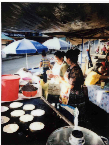
'Tortillas each day, every day'.

In Cambodia, rice was the most important agricultural commodity and the staple of the national diet. The concept of a meal was synonymous with eating rice, and rice was consumed at every meal prepared in the household. It was notable that when asked to list their daily food intake, participants frequently failed to mention rice due to their perception of it as a constant and guaranteed staple. Participants defined a nutritious meal as being a meal with ' balanced ' flavors that in addition to rice involved both wet (e.g. soup) and dry (e.g. fried or grilled meat) food categories. To accompany the rice, participants described preparing multiple dishes referred to as ' side dishes ' (including fish and vegetables), when they could afford to do so.