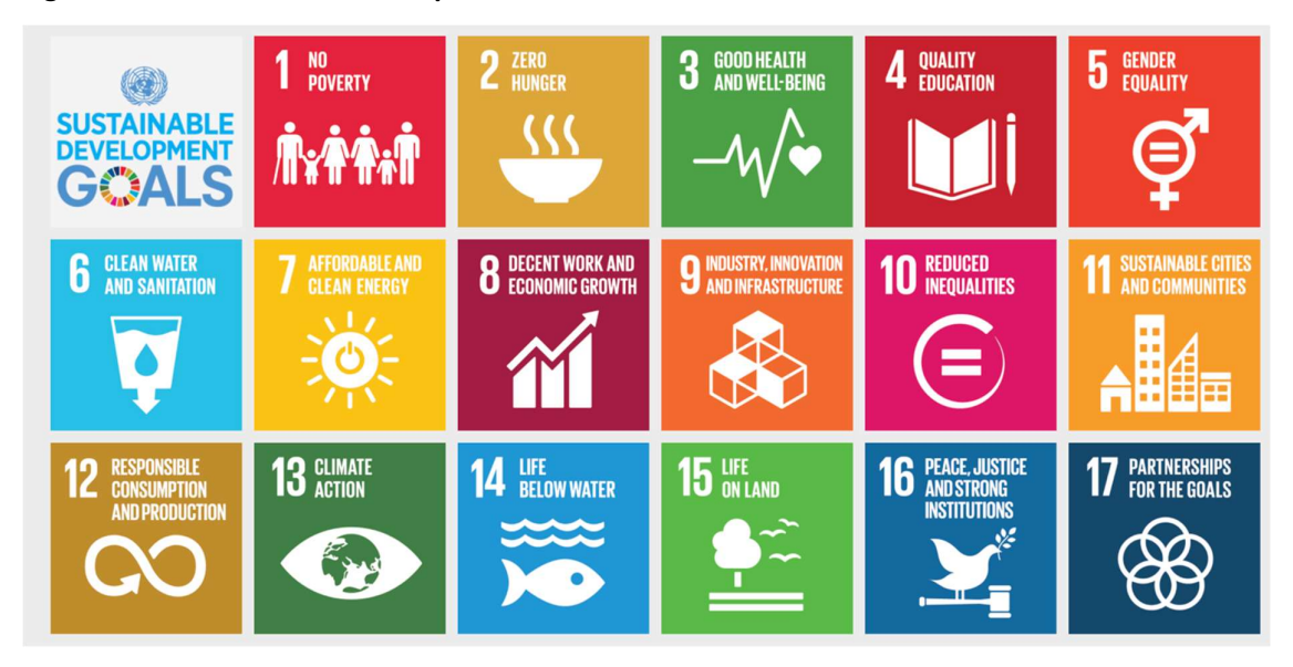
Figure 5: The Sustainable Development Goals

While it is important to make progress towards SDG 2, it should not be done at the expense of progress on other SDGs. The SDG 2 goal in and of itself is dependent on many of the other SDGs that should be implemented and scaled up. The connections between the SDGs are meant to improve the welfare of people and promote dignity, peace, and justice, while ensuring planetary health and prosperity, since these are all interconnected. Some examples of the connections are shown below (ICFS 2017):