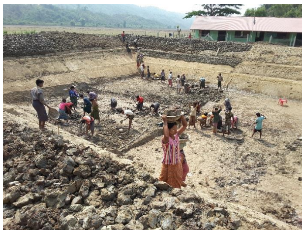
Caption: Kwan Taung Rakhine pond renovation in progress.

In Buthidaung Township of northern Rakhine State, WFP supported a pond renovation project through its cooperating partner, Myanmar Heart Development Organisation. The project implementation was accompanied by formal nutrition messaging to improve villagers’ knowledge of good nutrition practice. The pond renovation was completed over 41 days and WFP distributed a total of MMK 7,175,000 (USD 5,436) to 50 participants actively involved. WFP encouraged gender equality by providing men and women participants with equal opportunities and wages. The pond will provide access to clean water throughout the year.