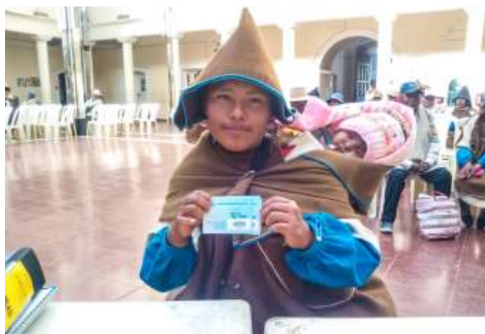
Caption: WFP voucher distribution as part of its emergency assistance in Uru Chipaya, department of Oruro.