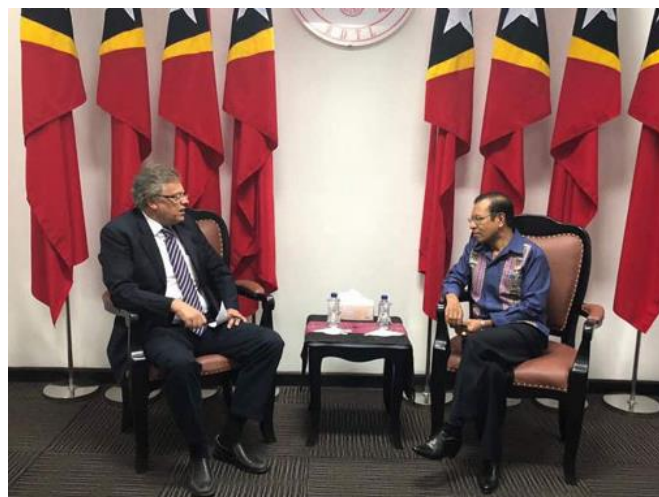
The Prime Minister H.E. Taur Matan Ruak met with David Kaatrud on 23 August 2018 at Government Palace, Dili.

WFP Regional Director for Asia and the Pacific David Kaatrud visited Timor-Leste and held several meetings with key relevant stakeholders including the Prime Minister, the President of Parliament, Minister of Agriculture and Fisheries, Minister of Social Solidarity and Inclusion, Minister of Education, Minister of Foreign Affairs and Cooperation, Minister of Legal Reforms and Parliamentary Affairs. The meetings helped renew and strengthen WFP's collaboration and with the Government to address food security and nutrition challenges in Timor-Leste under the new Country Strategic Plan (2018-2020).