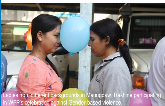
Ladies from different backgrounds in Maungdaw, Rakhine participating in WFP's celebration against Gender-based violence