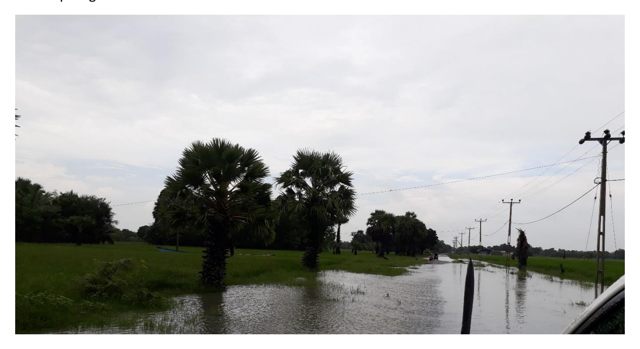
Submerged Road in Puliyampokkanai in Kilinochchi on 26 December

were used in difficult areas as transportation means. Few roads were still inundated due to continuous water spilling from several tanks in Kilinochchi.