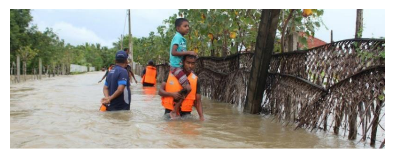
Floods in Kilinochchi on 22<sup>nd</sup> December

Since 23<sup>rd</sup> December, the situation gradually improved: the weather improved, with only minor showers received and approximately one third of the people who were displaced, had started to return to their homes. The Ministry of Disaster Management, District Secretaries and Military were responding to the needs of the affected people and the government immediately allocated 1 million rupees (US$5,500) per affected district for the provision of emergency needs. However, the rains increased on 26<sup>th</sup> December and the authorities had to keep displaced population for additional days in IDP safety centers. The rains had significantly reduced in these Districts since 27<sup>th</sup> December, and displaced people started to move back to their homes the following days.