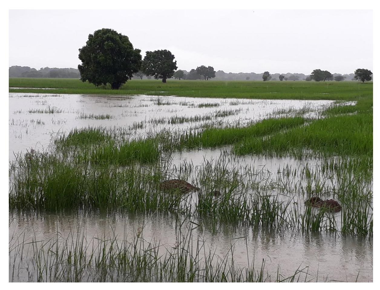
Flood affected paddy field in Kandawalai, Kilinochchi

Many farmers had invested their cultivation through loans as their income was diminished due to the loss of crops in 2016 & 2017 Maha cropping seasons. As a result of crop losses, indebtedness will be expected to increase among the affected populations.