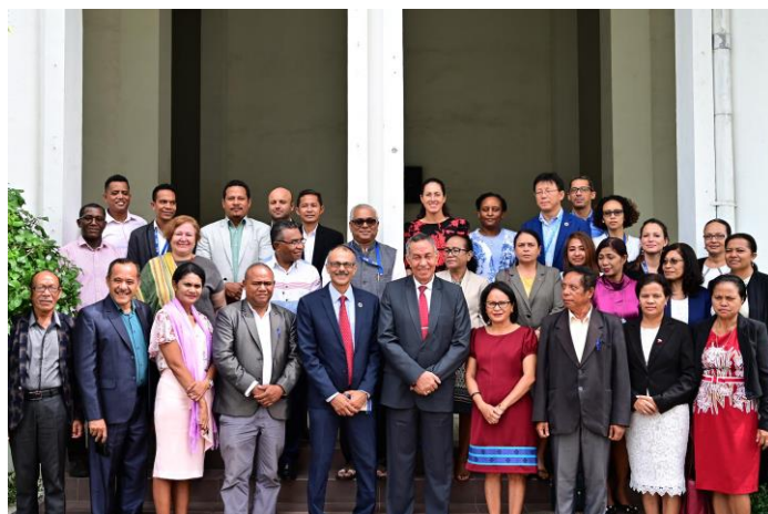
H.E. President of Parliament with members of parliament commission D and F together with UN Representatives after presentation at National Parliament.

Together with the UN Resident Coordinator and other UN Agencies (FAO, UNICEF, WHO and UNFPA), WFP held a nutrition session with the National Parliament Commission F and D to raise awareness about the status of nutrition and food security in Timor-Leste.