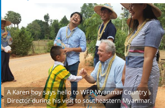
A Karen boy says hello to WFP Myanmar Country Director during his visit to southeastern Myanmar.