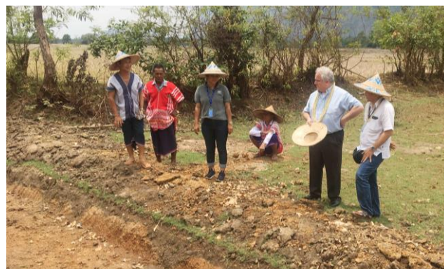
Photo: WFP Myanmar Country Director Dom Scalpelli explores opportunities for expansion of the asset creation programme in Kayin State

Southeastern Myanmar is a success story of humanitarian-development nexus intervention, however the lack of available funding is the primary constraint preventing WFP from building even further on this potential.