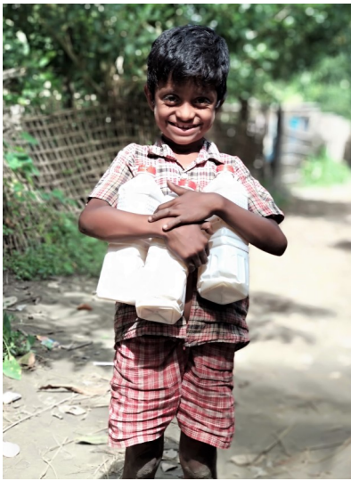
Photo: A young boy in Rakhine State seen with WFP's oil rations