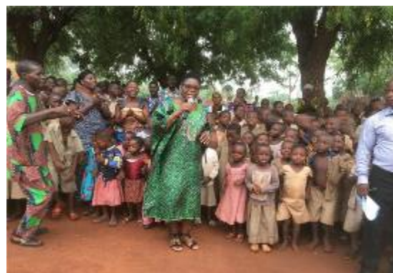
Children welcome the visitors at the Gboto Kholohé school.