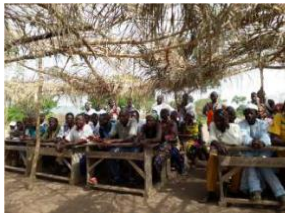
Meeting of the School Parents' Committee at Amalaklé Public Primary School, Togo.