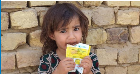
A girl eats WFP specialized nutritious food "Acha mum" at a food distribution site in Jawzjan Province.