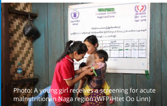
Photo: A young girl receives a screening for acute malnutrition in Naga region (WFP/Htet Oo Linn)