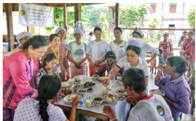
Photo: Beneficiaries try meals prepared in a cooking demonstration in Hpakant Township, Kachin State

Nutrition promotion month is an important nationwide initiative by the Ministry of Health and Sports which WFP was honoured to take part in. With refreshed commitments in August, WFP encouraged all its partners to keep the momentum alive through the coming months and years.