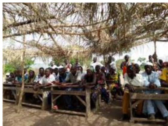
Meeting of the School Parents' Committee at Amalaklé Public Primary School, Togo.