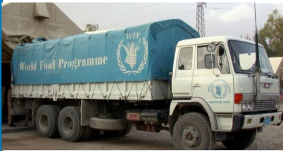
After 30 years in service driving across Afghanistan, half of WFP's fleet needs to be replaced.