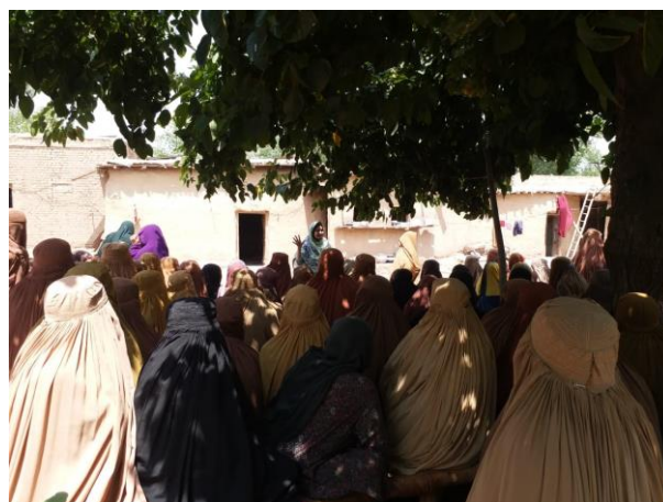
Women participating in a vocational training session, organized under the recovery support livelihood assistance project in FATA