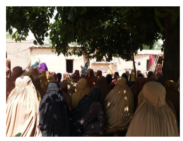
Women participating in a vocational training session, organized under the recovery support livelihood assistance project in FATA