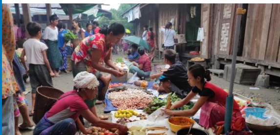
Photo: Vegetables at a local bazaar in Hpakant Township, Kachin State © WFP/ Haymar Aung