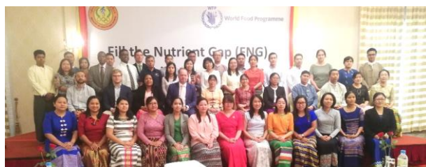
Photo: Partners gather at the FNG Dissemination Workshop held in Nay Pyi Taw, October 2019

The time is now ripe for Myanmar to diversify the food supply chain towards more nutritious foods. Household food production through home gardens and ponds can increase access to nutritious foods for rural households. School feeding and emergency rations also offer platforms to improve access to healthy diets. Combining effective interventions could reduce the cost of a nutritious diet to as low as 25 percent of its current cost.