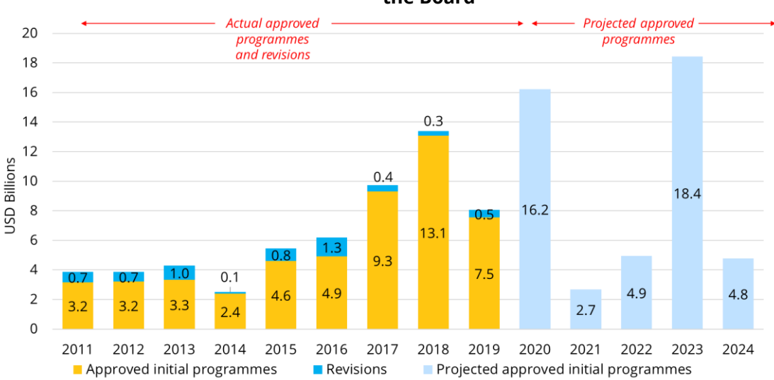
Figure A.II.2: Value of initial programmes and revisions approved by the Board

9. The Secretariat next analysed the annual value of only those programmes and revisions that had been approved by the Board. Figure A.II.2 shows the annual value of initial programmes and revisions approved by the Board for the period 2011–2019 and the projected value of approved programmes and revisions for 2020–2024. It was determined that the significant increase in the Board's approval role derives almost exclusively from its initial approval of CSPs and ICSPs, each of which includes the entire portfolio for a country, including crisis response.